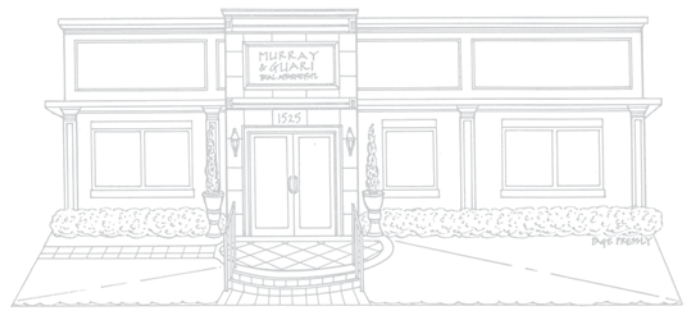
The Offices of Murray & Guari