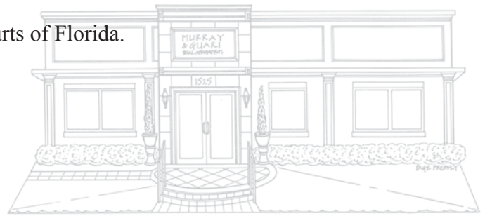
The Offices of Murray & Guari